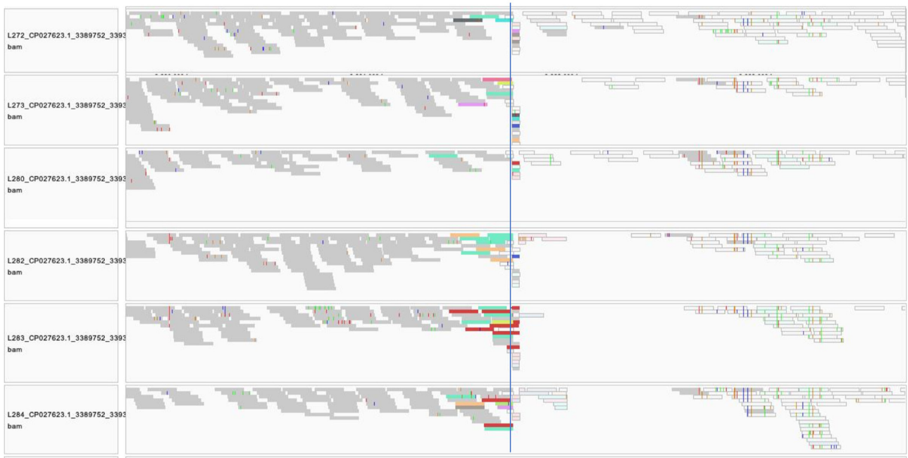
Fig. S3. Confirmation of Copia transposon insertion at position 3391752 on Chr13. The result is shown for six samples. The dashed vertical line indicates the insertion sit.