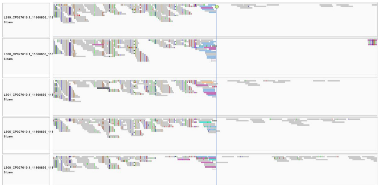
Fig. S4. Confirmation of hAT-Tag1 transposon insertion at position 11870656 on Chr1. The result is shown for five samples. The dashed vertical line indicates the insertion sit.